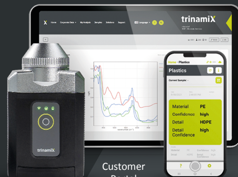
trinamiX PAL One mobile NIR spectrometer

* Carbon black plastics cannot be detected.